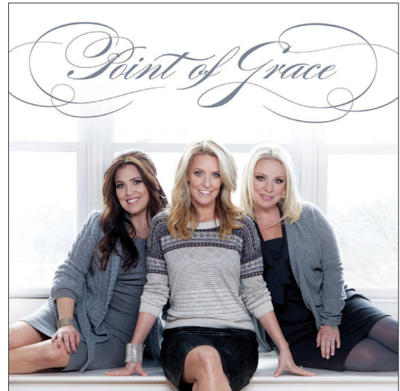
Point of Grace

With more than 8 million recordings sold, 3 Grammy nominations, multiple Dove awards, and countless accolades, the story of a few gifted college girls with a simple passion to unite and share their musical gifts for the Glory of God continues to evolve and engage thousands of fans, both old and new.