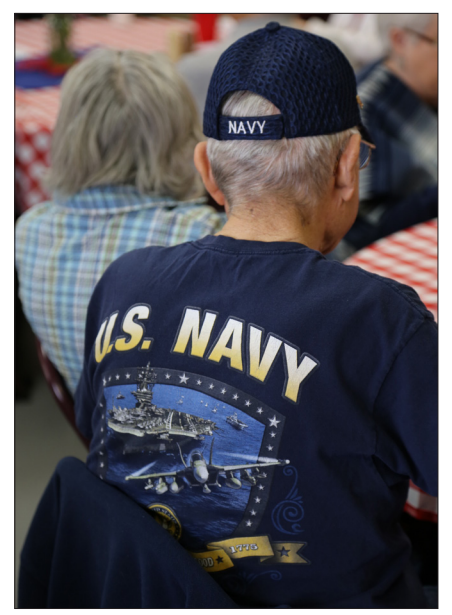
At First Baptist Norman we love to celebrate our veterans all year long! Thank you, ladies and gentlemen, for your service. We hope you enjoyed lunch on February 15.