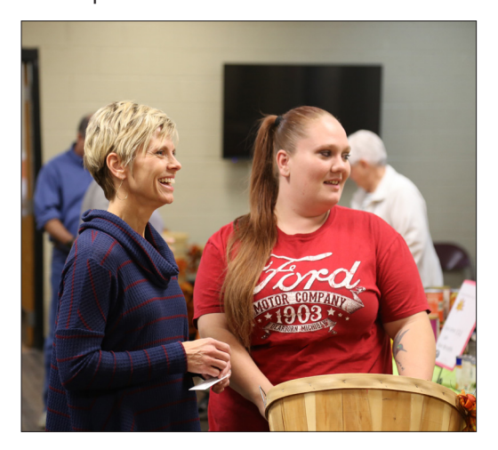
Thanksgiving Basket Party

Distributed 136 bicycles and locks to individuals in need of transportation, plus many children's bikes were given to the Baptist Children's Home