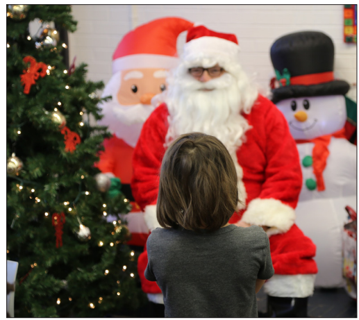
Christmas At Dimensions South